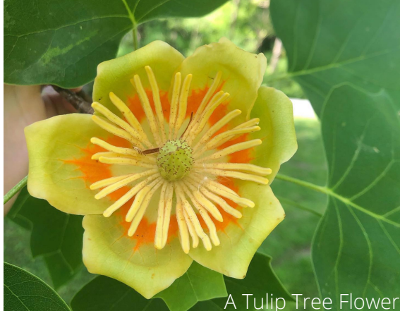
A Tulip Tree Flower