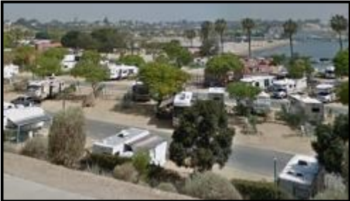
The park as seen from the Pacific Coast Highway

The pond, which is actually an inlet, is about 800 feet wide by 1,300 feet long — about a third of a square mile. It’s about a mile from the ocean as a crow (or even a sparrow) flies, but maybe four miles in a boat. Needless to say, you won’t see any crashing waves and ocean mist here as you might while camping along the Oregon coast on a beach created by nature, not men with backhoes.