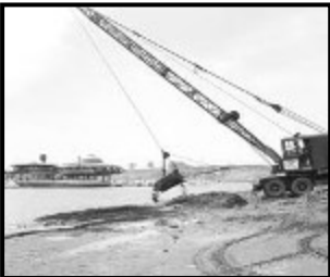
Newport Dunes under construction is 1960.

If you have a dog, add $2 a day. If you have more than one vehicle, add $20 a day. Want a fire pit? That’s $35 a day. And go ahead and invite a guest ($18 for up to two hours).