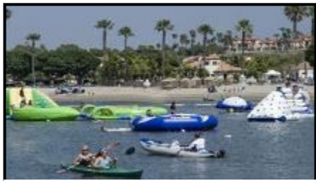
There’s no crashing surf or ocean mist, but there are plenty of inflatables!

There’s a hotel, which doesn’t matter to you and me. What matters to us is that the hotel has an RV park, which it labels a resort, which many RV parks do these days so they can charge more. I am reminded of the saying “You can put lipstick on a pig, but it’s still a pig,” which is true of many RV “resorts.” Not saying there aren’t those places that are worthy of the term, but for many it’s stretching it.