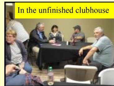
In the unfinished clubhouse