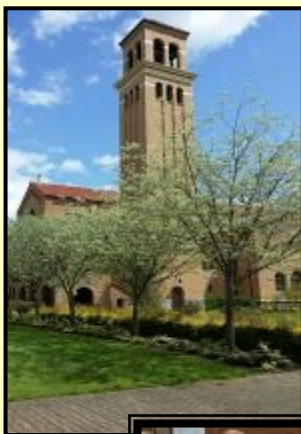
The Abby in Mount Angel