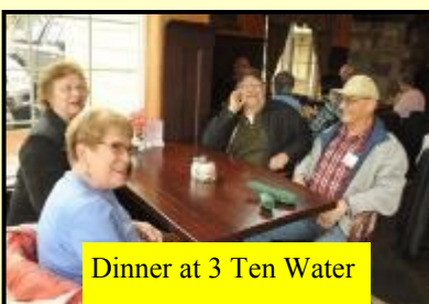
Dinner at 3 Ten Water