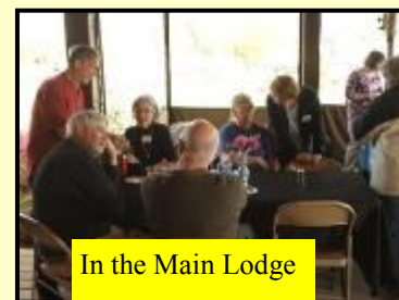
In the Main Lodge