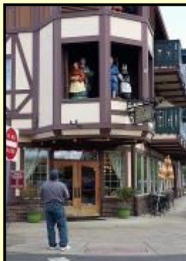
Rod Robbins watching the Glockenspiel in Mount Angel