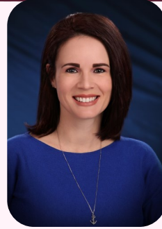
Mayor Jenney Rees

This is an important topic and I will continue to work with many others in our area to address it. As we continue to meet, I will share with residents resources that are available and ways we are working to provide intervention strategies. For more information on the SafeUT app, visit safeut.med.utah.edu .