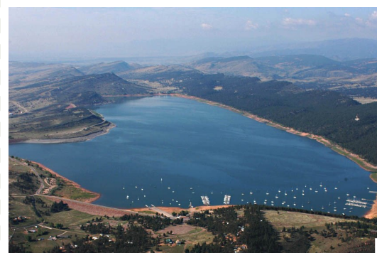
Aerial view of Carter Lake looking south

VIOLATION (NO ABBREVIATION) – Failure to meet a Colorado Primary Drinking Water Regulation.