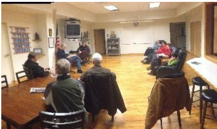
-A few open seats; to be filled at this February meeting!