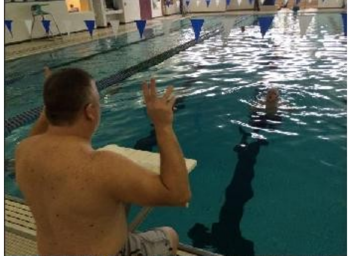
"10 mins to go..."