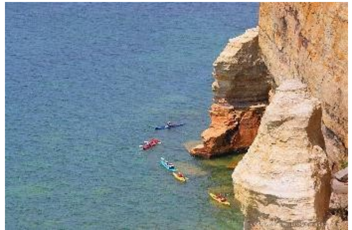
Gorgeous views by kayak!

http://www.paddlingmichigan.com/pictured-rocks-national-lakeshore-day-trip/