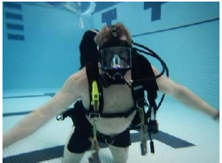
No name tag?

For full story, see http://www.mlive.com/news/saginaw/index.ssf/2015/01/saginaw_dive_team_members_test.html