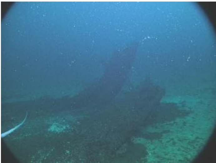
Le Griffin today?