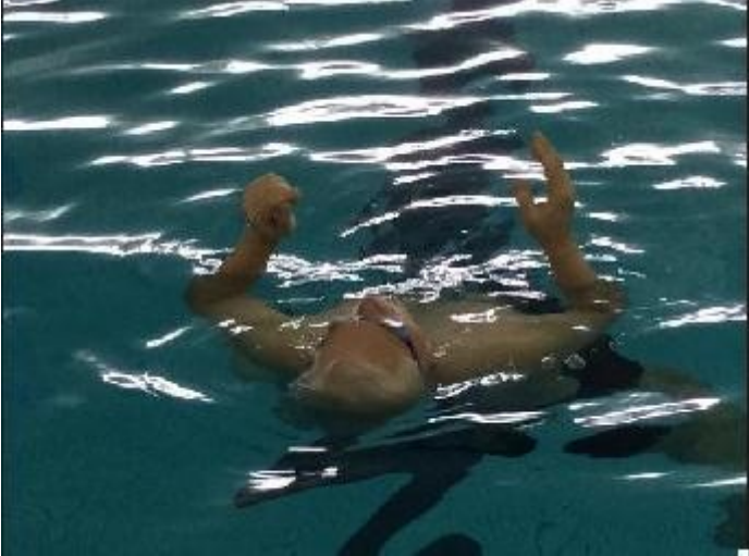
“Hands Up!; Don't...”