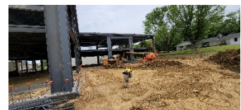
This is the area where the garden will be located