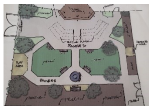
Artist's rendering of the garden area