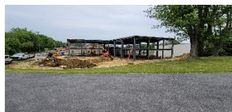
The Women's and Children's Center