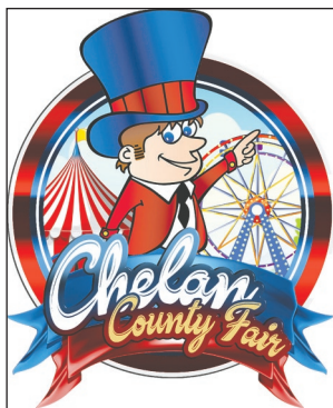
Chelan County Fair

As of July 3, Okanogan County was in Phase 2 of the state's Safe Start Washington four-phase reopening program. Chelan and Douglas counties remained in modified Phase 1-1.5 status. Phase 1 bans all gatherings while Phase 2 restricts gatherings of no more than five persons outside a family group. Phase 3 allows up to 50 people in a gathering but only Phase 4 permits unlimited numbers.